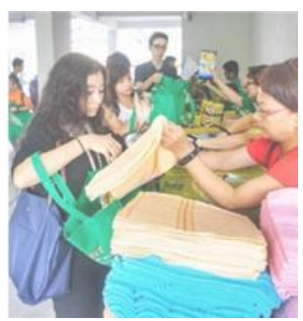
Expanding the range of volunteering opportunities

MCCY notes the Workgroup's list of key places of interest in Table 2 (p16) of their report, and will explore expanding the current learning journey to include some of the locations as suggested.